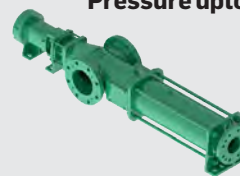
Horizontal RB Series Pump Flow rate upto 250m3/hr Pressure upto 12bar